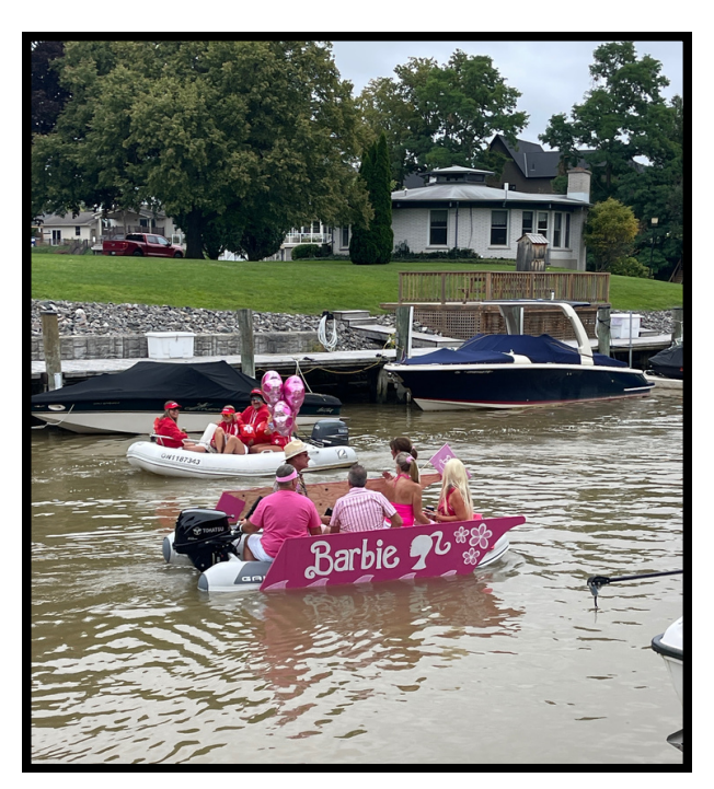
"We would like to thank the people of Jessica's House Hospice for everything they do"